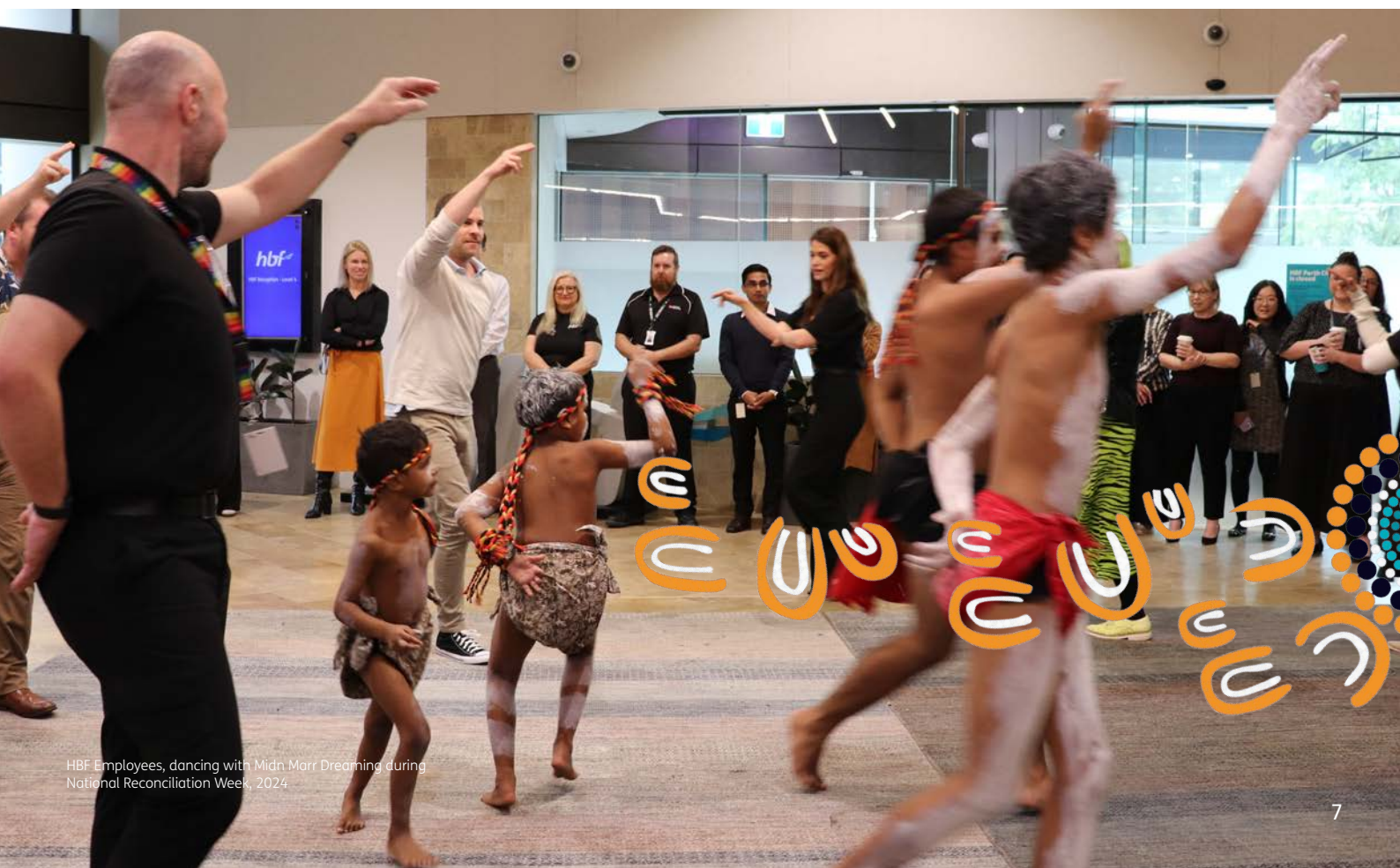
HBF Employees, dancing with Midn Marr Dreaming during National Reconciliation Week, 2024.

The success of HBF's RAP is reliant on all our people. Their contributions, no matter how big or small are what will make our vision a reality – everyone has a role to play. By working together and staying committed to our core values, we can play our part in contributing to a healthier future for all Australians.