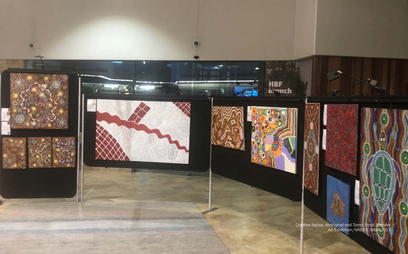
Creative Native, Aboriginal and Torres Strait Islander Art Exhibition, NAIDOC Week 2023