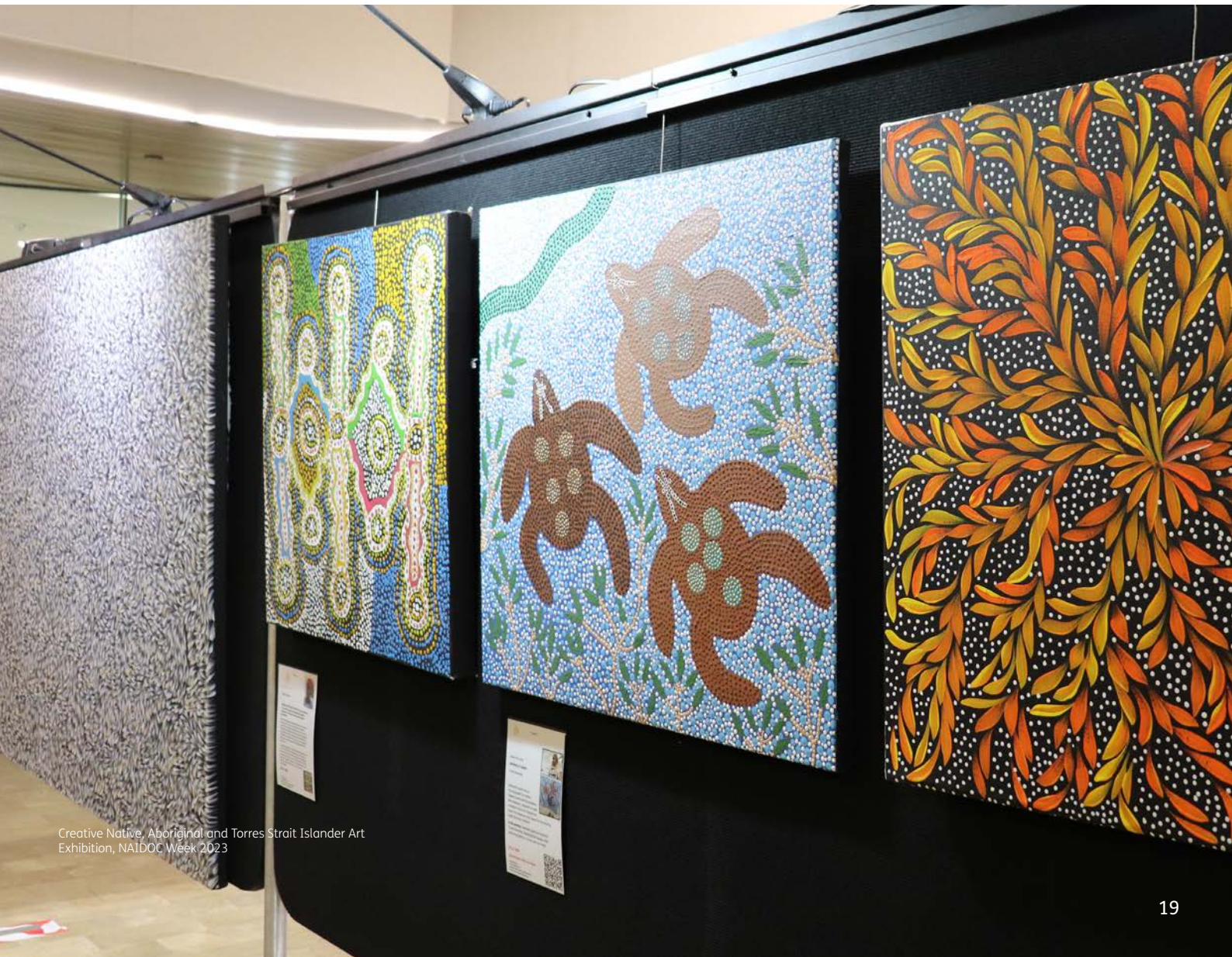
Creative Native, Aboriginal and Torres Strait Islander Art Exhibition, NAIDOC Week 2023