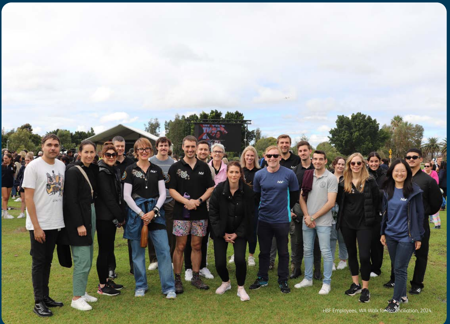
HBF Employees, WA Walk for Reconciliation, 2024.

Our governance structure for our Reflect RAP consists of the HBF RAP Working Group, which will meet at least four times a year, comprise of representatives from each area of our business. The purpose of these Working Groups is to ensure that the outcomes of the RAP are carried through at the operational and local level. They will also meet at least four times a year. Each member of the business unit reconciliation working group and Group RAP Steering Committee will serve as our organisational RAP champions.